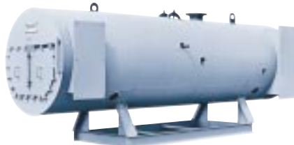
'Scotch' Waste Heat